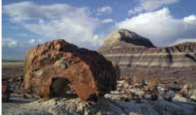
Petrified Forest NP

Your passion for motorcycle riding will be repaid today as we open the throttle and let the wind fly by. The morning's view is outstanding. There are some long stretches and a few twisty curves in the morning but later on it all opens up. By the afternoon we are treated to an odd and wonderful sight as we approach